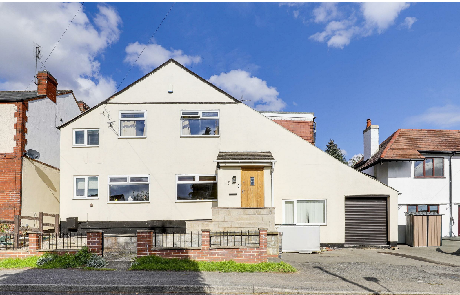
Stanley Road, Mapperley, Nottinghamshire NG3 6HT